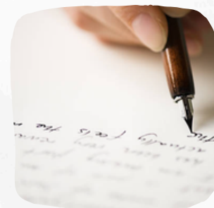
Recommendation letter (based on performance)