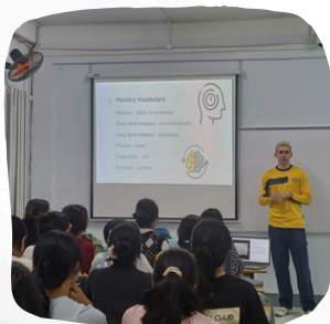
TESOL Certificate issued by TESOL partners ( https://tesol.newinsightedu.com/en ); $15 fee for physical certificate shipping to global address