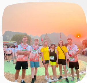
Participation in C4C and VEN activities