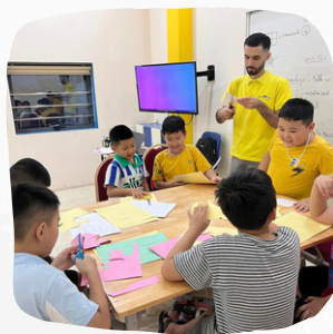
Supervised teaching practicum