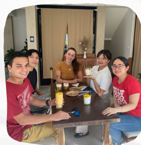
Introduction to teaching opportunities at C4C partner schools across Vietnam