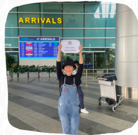
Airport pickup and drop-off (Da Nang International Airport)