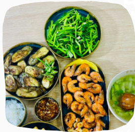
All meals and daily drinks