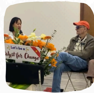
Ongoing mentorship and feedback