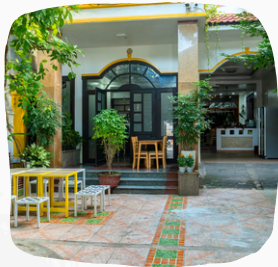
Accommodation at C4C House (Da Nang)