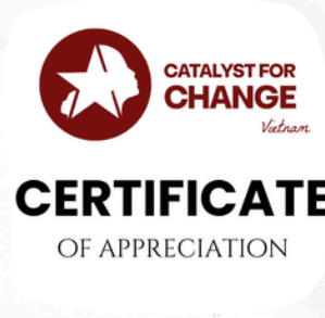
C4C confirmation letter of teaching practice